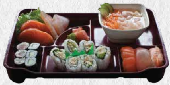
SUSHI BENTO BOX 21

Beef Teri-Don, Assorted Sushi, Tempura, California Roll & Salad