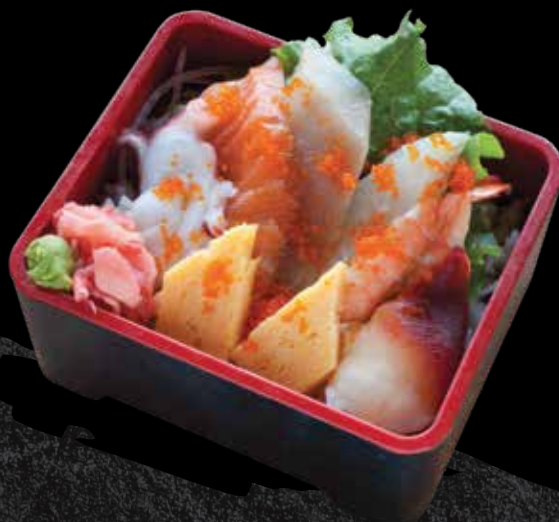
CHIRASHI DON 17