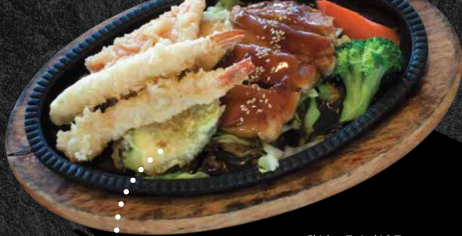
Chicken Teriyaki & Tempura 照燒雞扒 + 天婦羅