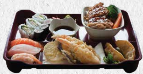
SPECIAL BENTO BOX 20

Chicken Karaage, Salmon & Tuna Sashimi, Tempura, California Roll & Salad