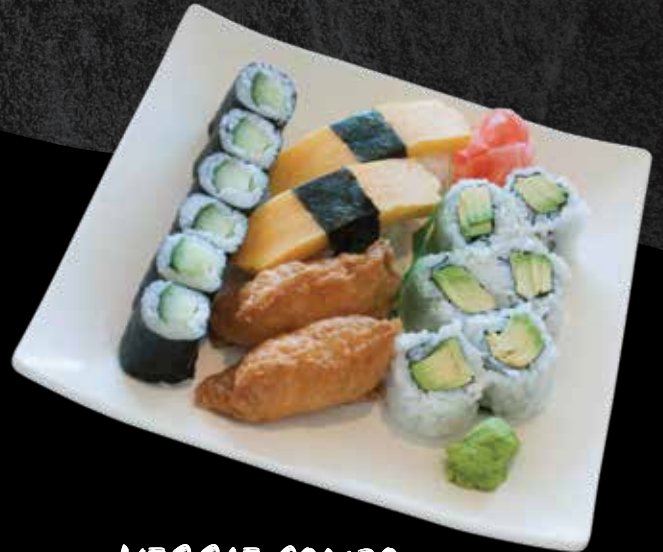
VEGGIE COMBO 16