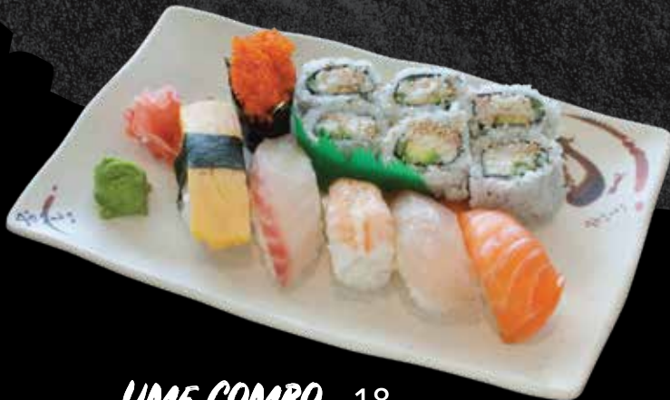
UME COMBO 18