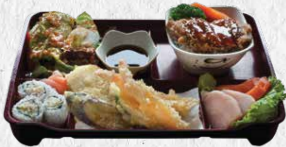
BENTO BOX A 19

Chicken Teri-Don, Salmon & Tuna Sashimi, Tempura, California Roll & Salad