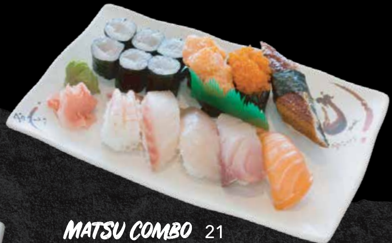
MATSU COMBO 21