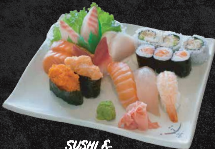
SUSHI & SASHIMI COMBO 24