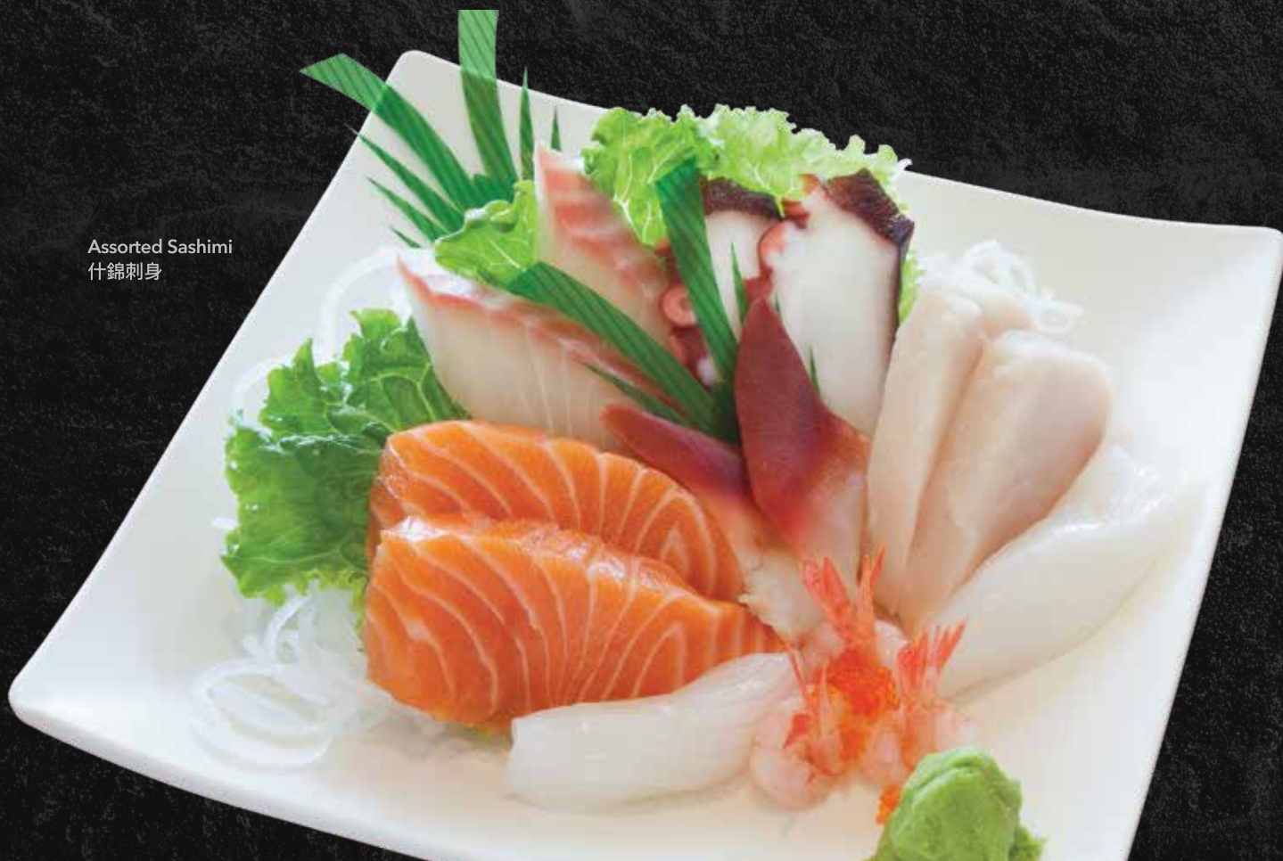
Assorted Sashimi 什錦刺身