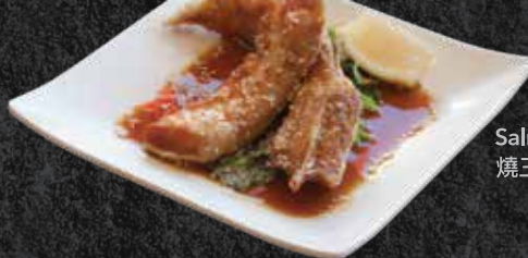
Salmon Belly 燒三文魚腩