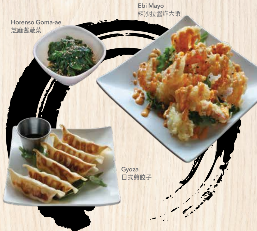
Horenso Goma-ae 芝麻醬菠菜