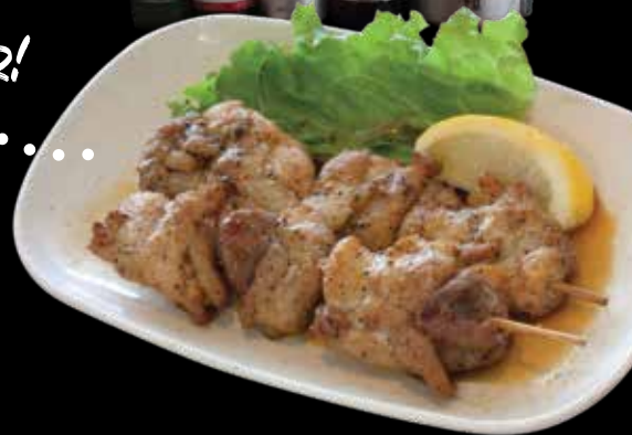
Yakitori (Chicken Skewers) 燒雞串