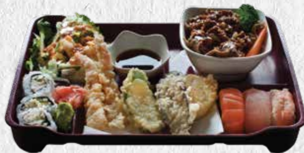
BENTO BOX B 19

Unagi Don, Tempura, California Roll & Salad