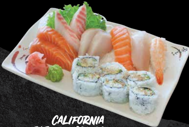
CALIFORNIA SASHIMI COMBO 20