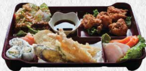
BENTO BOX C 19

Assorted Sushi, Salmon & Tuna Sashimi, California Roll, Shrimp Sunomono, Tuna and Kappa Maki *No side of rice included