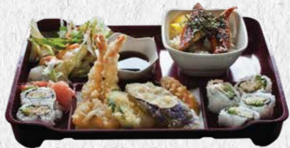
UNAGI BENTO BOX 20

Chicken Teri-Don, Salmon & Tuna Sashimi, Tempura, California Roll & Salad